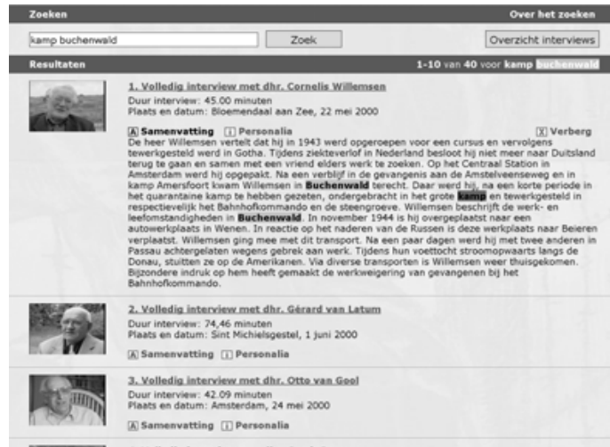
Figure 3: Result listing for the Buchenwald collection.