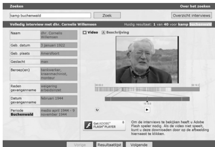
Figure 4: Video playback for the Buchenwald collection

In many use scenarios people are not just interested in finding (a list of) pieces of information in a certain modality on a certain topic, but in exploring available information from several perspectives, in particular in the case of historical narratives. Here, visualization of chronological details, collateral texts, references to related publications, etc., can all have added value for the way in which people interact with content or for the way in which the information can be used for scholarly analysis. Requirements for navigation in multifaceted, multimodal or otherwise heterogeneous content are not yet well explored, and it is an open question whether generic guidelines can be given for the generation of a well balanced choice from multiple perspectives. HMI approaches these questions by focusing on content for which real users who can engage in evaluations are likely to be found. An example is the time-aligned multimodal presentation via multiple screens of The Diary of Anne Frank .