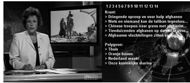
Fig. 2. Main window of the demonstrator. The video is displayed left and the hyperlinks are shown on the right. Using navigation-bar in the top-right corner the user can jump directly to other segments.

Teletext subtitles have the tendency to be brief and omit parts of speech while a speech recognition system can only recognise the words in the vocabulary. Therefore many new names and places cannot be recognised. Even when both speech recognition and teletext subtitles do not provide complete error-free transcriptions, adequate retrieval of documents is still possible as long as WERs are below 50% [12, 1]. Results from TRECVID show that for retrieval of video the application of ASR transcripts contribute considerably to retrieval performance figures [13].