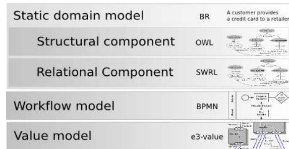
Fig. 1. The overall model.

checking of properties overlapping the dimensions of a single model. A basic property is the contradiction freeness of the representations of the different facets.